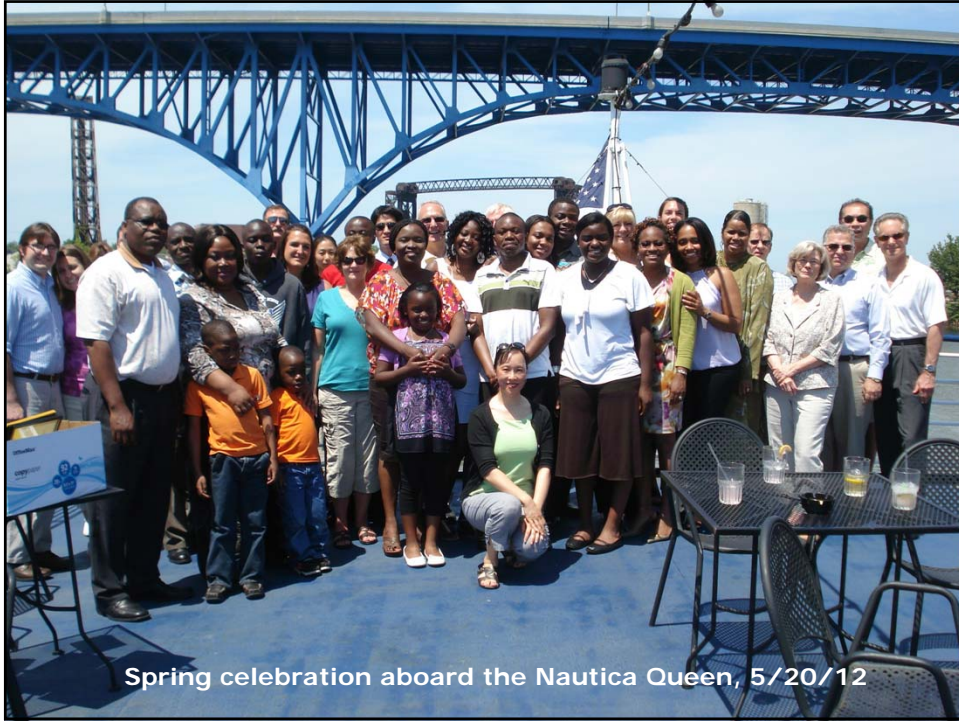
Spring celebration aboard the Nautica Queen, 5/20/12