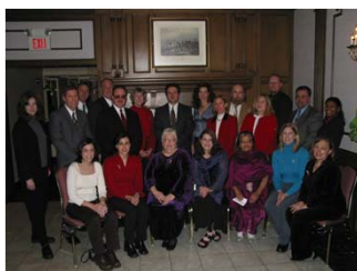
Students from all classes during our December 16, 2003 accreditation celebration